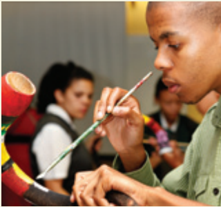
An Iziko Summer School 2011 participant painting a kelp vuvuzela.