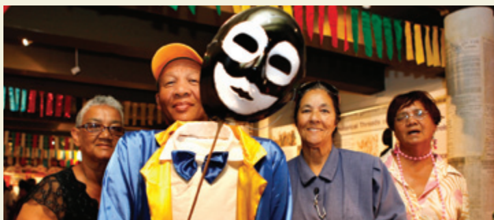
Delegates at the Ghoema & Glitter: New Year Carnival in Cape Town moppie-writing workshop, Iziko Summer School 2011.

Presented by IZIKO Education & Public Programmes