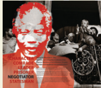
A panel from the Mandela: Leader, Comrade, Negotiator, Prisoner, Statesman exhibition.

Iziko Summer School 2012 04.02.12 - 25.02.12 iziko m u s e u m s