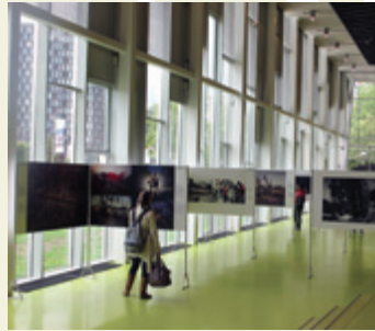
The 2010 World Press Photo exhibition.

Iziko Summer School 2012 04.02.12 - 25.02.12 iziko museums