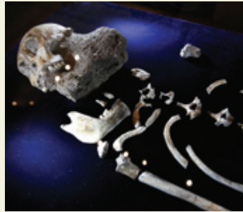
Australopithecus sediba .