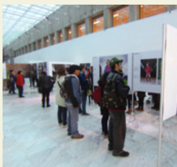
The 2010 World Press Photo exhibition.

Presented by IZIKO Education & Public Programmes