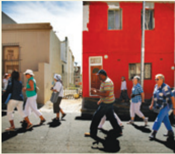
Iziko Summer School 2011 delegates on a walkabout in the Bo-Kaap.