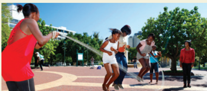
Participants in the Indigenous Games Workshops, Iziko Summer School 2011.