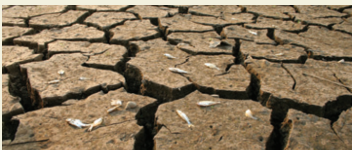
The effects of 'global warming' and climate change.